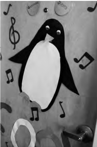
Palo Verde Penguins

Unfortunately, if your city did not decorate prior to 8am this morning, now is too late to worry about it. In the meantime, if you're one of those girls who hasn't had enough time to get out and see some of the "cool" stuff other cities have done, then checkout the artwork shown here and think you'll find them creative and fun!