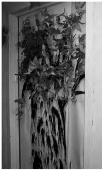
Ironwood Dragons (these are real leaves attached to a paper tree)