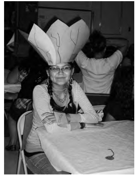
Love that multi-colored head tulip..

It was just 3 (long) days ago that approximately 280 young ladies arrived at the U of A campus for GS. Most of them were uncertain what the week would bring. Most of them, completely void of any of the political procedures in running for any public office and today, these same 280 girls are busy making posters, dressing in funny