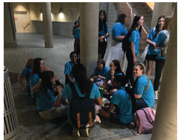
Girls state citizens practice interpersonal and networking skills. (Submitted)