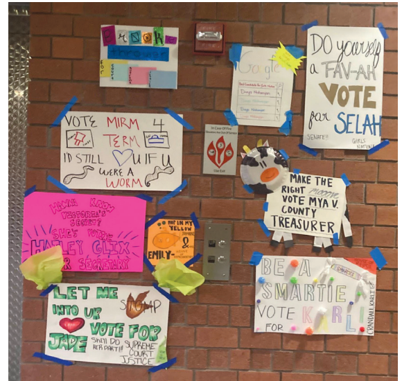
Campaign posters decorate common areas. (Submitted)

Be sure to drink lots of water this week and stay hydrated! It is going to be hot!