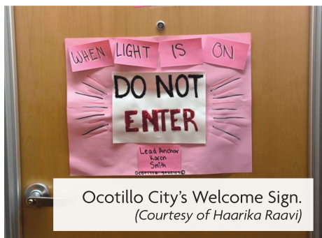
Ocotillo City's Welcome Sign.

Overall, the utter spirit and motivation that comes with Girls State has appeared to enrapture its citizens as we move forth through the week, with the city themes certainly bringing the absolute energy intended.