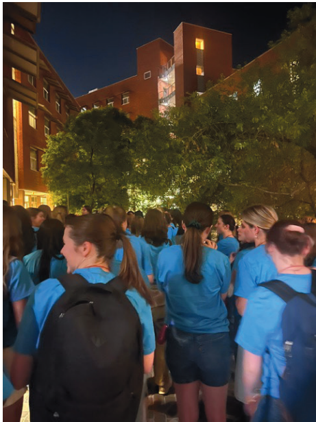
A crowd of federalist herd together in hopes of a successful rally.

Marching towards each other, the federalist and nationalist meet in the middle for a chanting battle that challenges the commitment and support within each party.