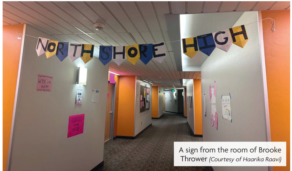
A sign from the room of Brooke Thrower

To begin with the entrance, as one approaches from the start of the hallway, they are warmly introduced to the city of Ocotillo with a sign that hangs from side to side, reading "Welcome to Northshore High," referencing the infamous high school which the central characters, the