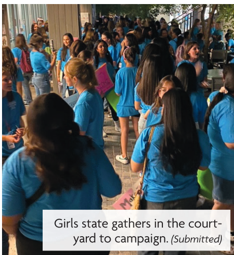
Girls state gathers in the courtyard to campaign. (Submitted)

The girls of Girls State entered their first day of campaigning. The exciting day consisted of county and state nominations, where the girls introduced themselves and obtained the signatures they needed.