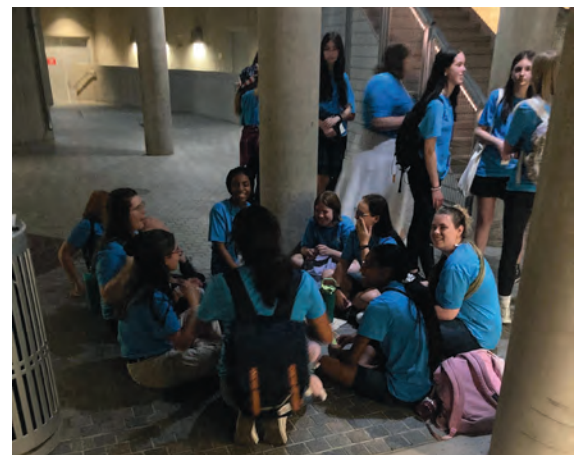
Girls state citizens practice interpersonal and networking skills. (Submitted)