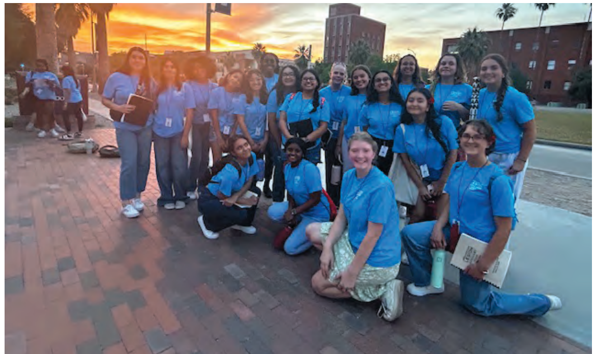
Latest group photo of Manzanita City.

With this knowledge I present to you a song by Joe Keery, the inspiration of this article," another version of me, I was in it. I wave goodbye to the end of beginning"; and on behalf of Manzanita city, this meeting is dismissed.