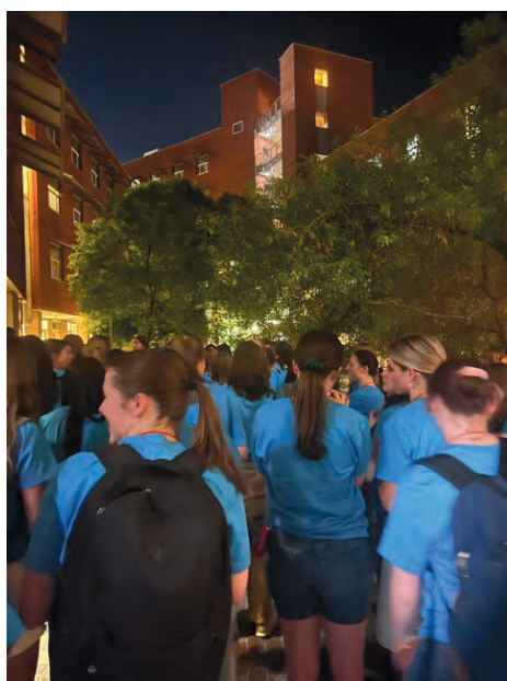
A crowd of federalist herd together in hopes of a successful rally.

Marching towards each other, the federalist and nationalist meet in the middle for a chanting battle that challenges the commitment and support within each party.