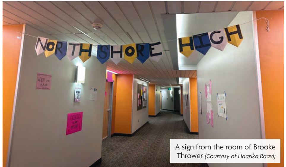
A sign from the room of Brooke Thrower

To begin with the entrance, as one approaches from the start of the hallway, they are warmly introduced to the city of Ocotillo with a sign that hangs from side to side, reading "Welcome to Northshore High," referencing the infamous high school which the central characters, the