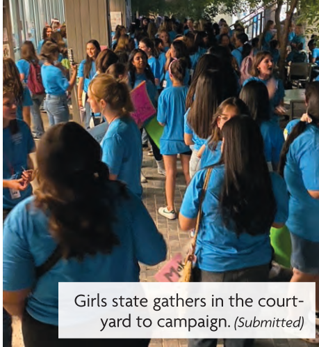
Girls state gathers in the courtyard to campaign. (Submitted)

The girls of Girls State entered their first day of campaigning. The exciting day consisted of county and state nominations, where the girls introduced themselves and obtained the signatures they needed.