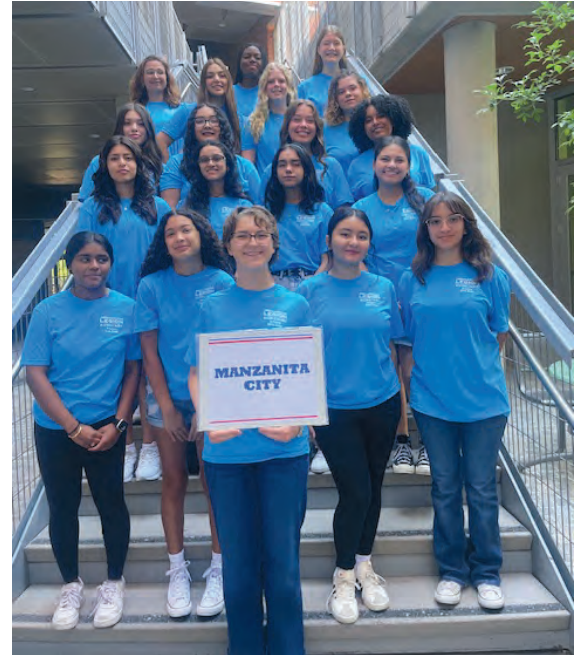
First group photo of Manzanita City.

The walks we walked, connections we made, and smiles we shared, will be held in all of our hearts. As we head to talent night, I can speak for Manzanita when I say, every girl is talented and has so much potential for success.