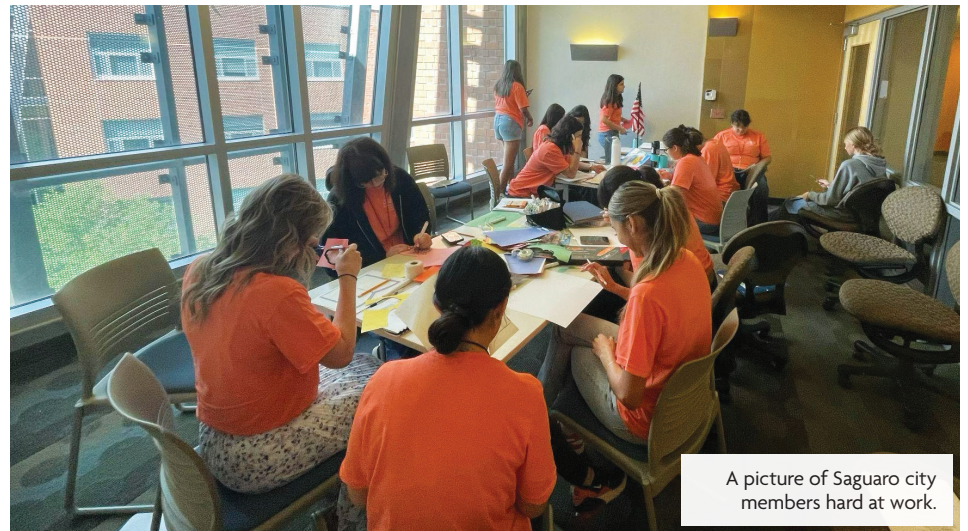
A picture of Saguaro city members hard at work.

Some unsuspecting Girls State citizens have been faced with something truly frightening. Official reports claim that