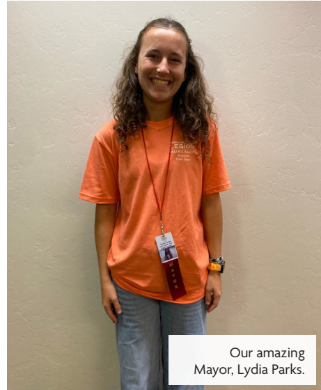
Our amazing Mayor, Lydia Parks.