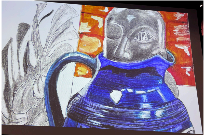
Mixed Media Art by Samantha Lika

The short animation followed a dinosaur as it built a LEGO house, combining humor and creativity. Audience members were awed as the